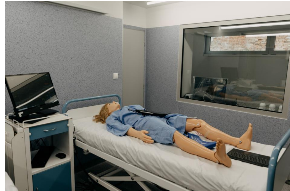
Image 1. Simulation environment

Methodology that offers the possibility of performing safe and controlled way a practice in a clinical setting that simulates professional reality.