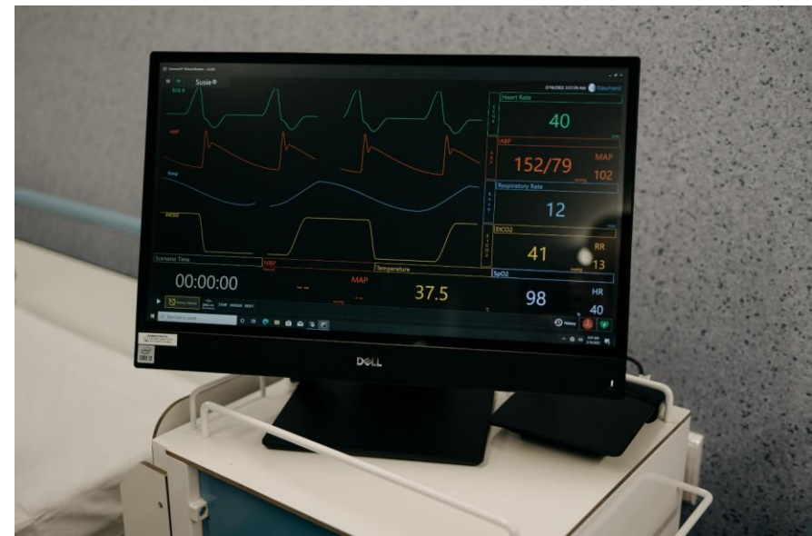
Image 2. Simulation environment